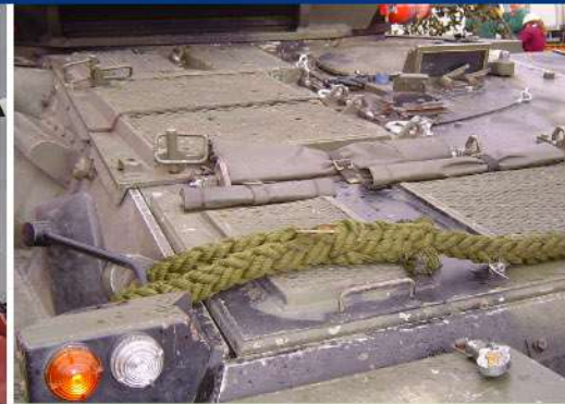
TOWING & RECOVERY